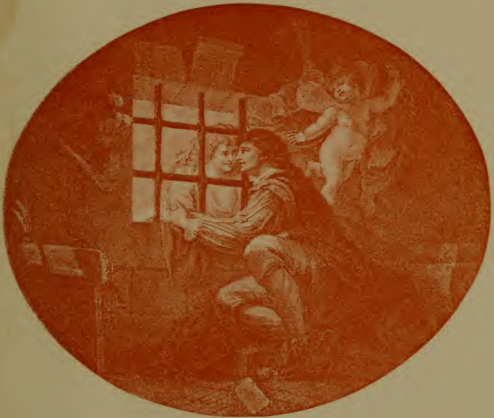
LOVELACE IN PRISON